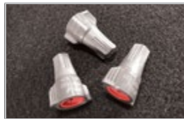
Wet Location Rated Wire Nuts