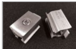
Cast Stainless Steel Mounting Clips