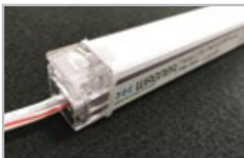
Linear Fixture, Length Varies