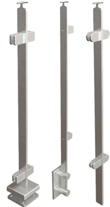
Flat Blade Post