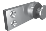
Single Flat Arm