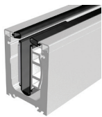
Level Lock™ Shoe

Each Level Lock™ Install Pack includes: Aluminum Cladding, Nine Level Lock™ Mechanisms, 10' Surface Mount Aluminum Shoe, Counterbored Holes in Shoe (12" on center), Mill Finish Extrusion, Rubber Gaskets, End Caps and Joint Alignment Pins