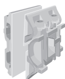
Level Lock Plus TM Mechanisms