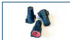
Wet Location Rated Wire Nuts