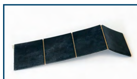
Self-Adhesive Insulator Squares