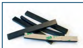
Self-Adhesive Fixture Spacers